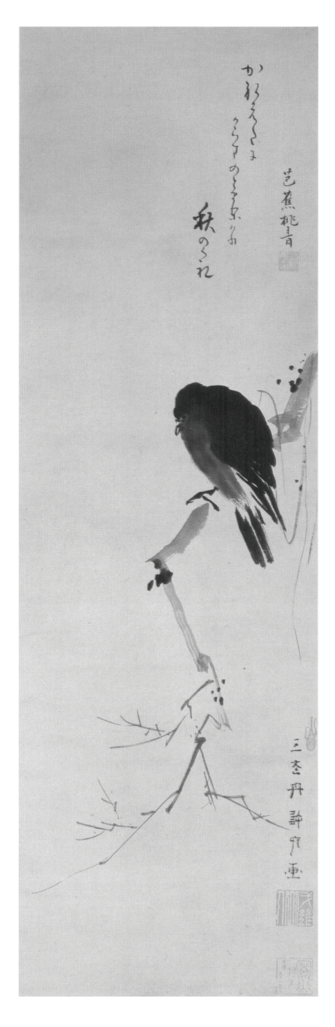
Figure 4. "On a Withered Branch" ( Kareeda ni karasu no tomarikeri aki no kure ), 1692-93. Signed "Bashō Tôsei." Painting by Morikawa Kyoriku. Idemitsu Museum, Tokyo.

In 1692-93, more than ten years after the first version, Bashō produced this gasan (painting with poem; Figure 4), a painting by Morikawa Kyoriku (1656-1715) with the calligraphy and hokku by Bashō.