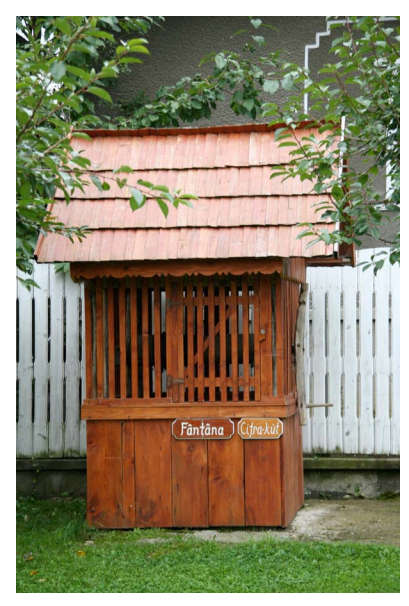
Decorative well 3, 2007