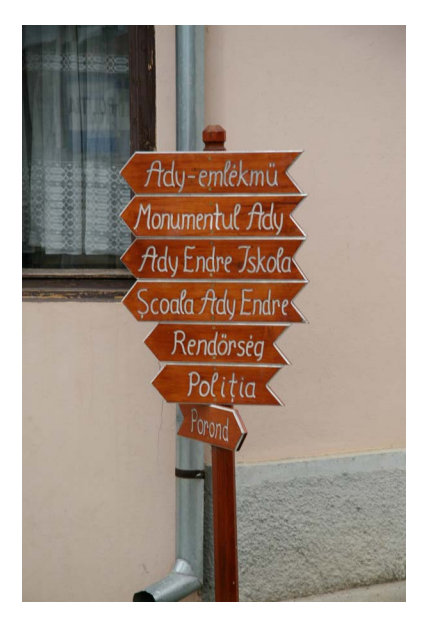
Signage 2, 2007