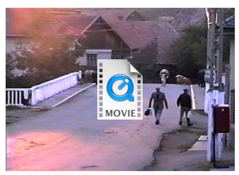
Walking the milk can to the collection point (2000): This ritual ended as Romania began to conform to EU guidelines that do not allow for the pooling of milk from individual households.

People report that there is scarcely a vacant home in Kalotaszentkirály. In many surrounding villages, however, the population is said to have declined precipitously. Although the community is still close-knit, it appears that eventually more and more houses will become weekend retreats for urban folks. The traditional social fabric of village communities will deteriorate further. Vacation homes are still rare in Kalotaszentkirály, and, as noted above, the