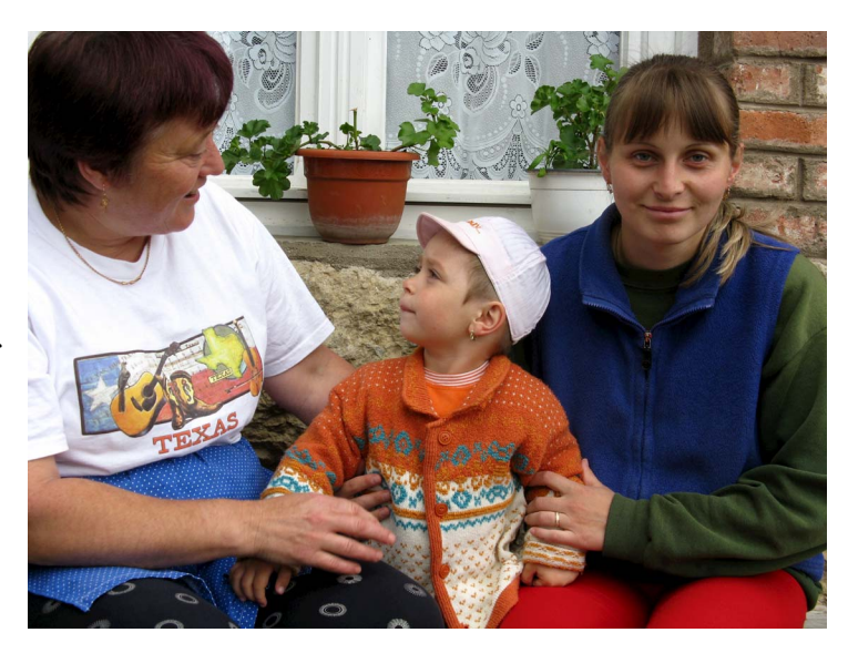
Bench and social interaction, 2010

The everyday social life of the community is centered in the village streets and in front of the village houses. Some decorative gates and benches have appeared recently in a style that is not native to this folk cultural area, but rather imitative of that of Szeklerland. In moments of leisure, villagers sit on their benches and interact with passersby going about their business. Villagers ask one another where they've been, where they're going, whom they've seen, what they're doing,