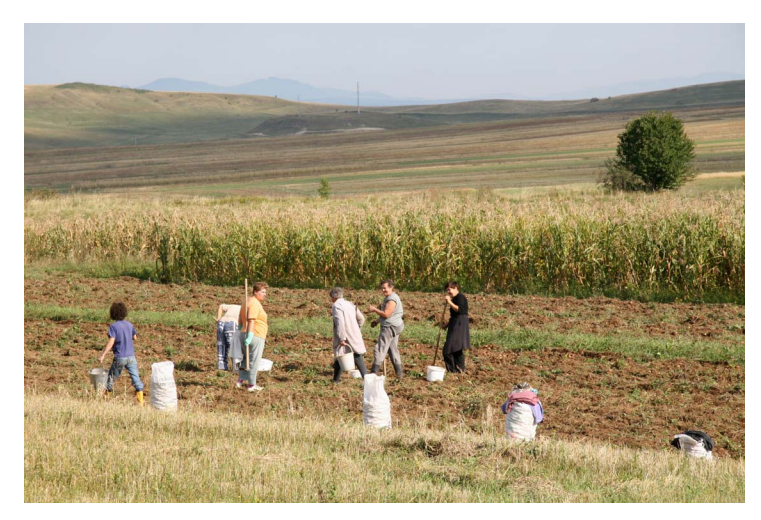
Potato harvest work party, 2007