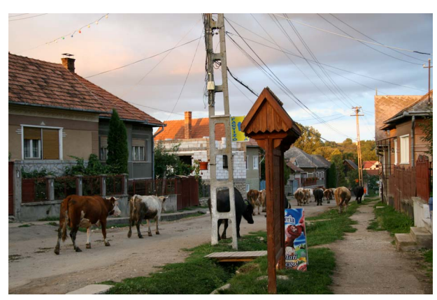
Part of the herd at dusk, 2007