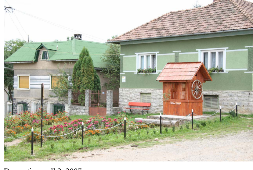
Decorative well 2, 2007