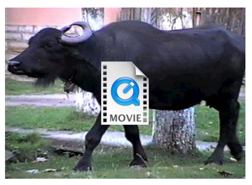
Water buffalo returning from pasture (2000): As the herd returns to the village, the buffalos and cows enter their own yards/barns for the night. By the time the sizable herd reaches the further end of the village, its numbers are already greatly diminished.

Farming has long been the foundation of such village communities, and Western visitors to this village might have sensed that they were enjoying a very authentic, old-fashioned experience—a step far back in time. In season, fresh food was abundant, including meat and dairy products. Villagers used horse- and buffalo-drawn wagons, water buffalo being this village's signature livestock. The sight of the great herd of water buffalo,