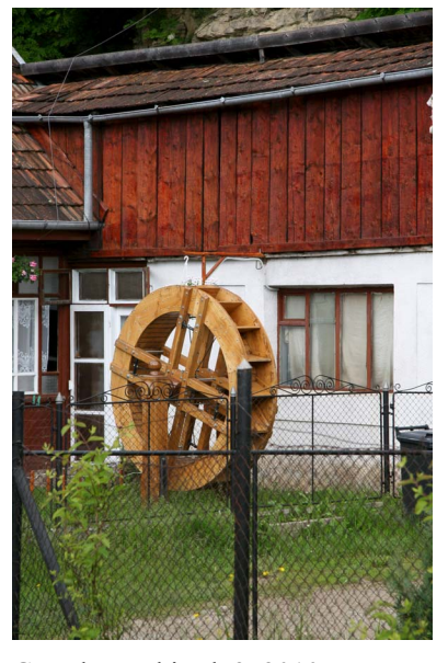
Guesthouse kitsch 2, 2010

It is clear that things are happening in Kalotaszentkirály, and the dynamo of economic development is tourism. The brand-new sign that welcomes tourists through its well-kept streets is a model of tidiness that village tourism requires. Three surviving public wells have been restored very nearly to picturesque status, while spruced up guesthouses have taken a turn that may strike an urban observer as kitsch. Beside one guesthouse a decorative millwheel is, rather incongruously, a few yards from a tiki lawn table.