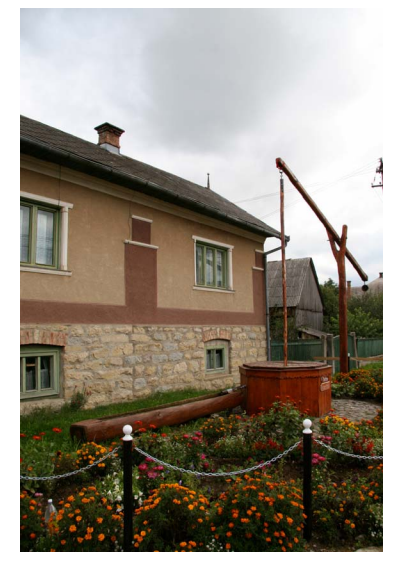
Decorative well 1, 2007