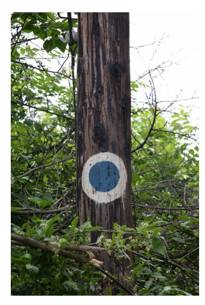
Path marker, 2010

Small farming and village tourism, along with a revitalized cultural identity, seemed to define Kalotaszentkirály. More recent developments have begun to signal great change. For instance, in 2010 the village installed a new decorative welcome sign that perhaps responds to what local people think guests expect. There are also quaint new directional signs all around the village to help visitors conveniently find their way. At the edge of the village, walking and hiking trails also begin with their own special markers.