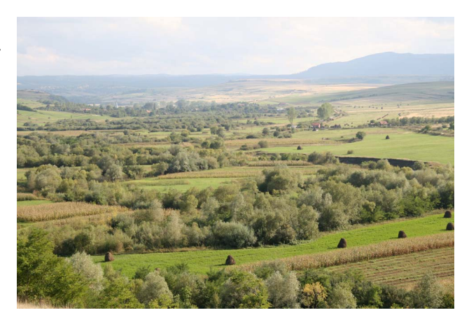
Trouser-belt fields 1, 2010

Holding scattered fields meant that it Trouser-belt fields 2, 2010