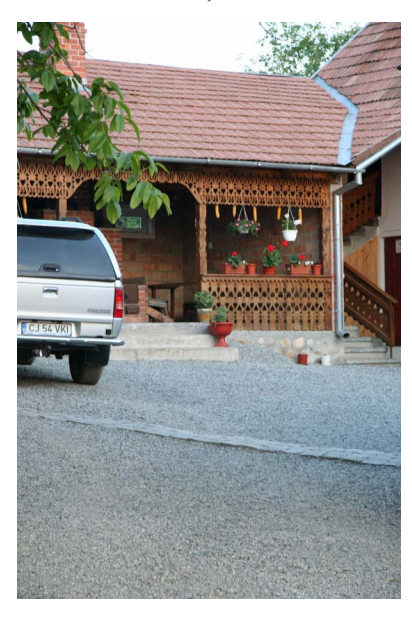
Guesthouse kitsch 1, 2010