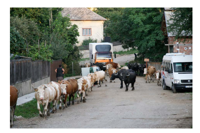
Herds return from pasture 2, 2007

A donation from outside furnished the village with its own new slaughterhouse. There seems to be some mystery about its funding. The villagers celebrated its (near) completion, but it never opened. Perhaps the villagers lacked the necessary capital to run it, or it may have been the case that the village could not provide the economy of scale necessary to support inspectors and to meet other EU requirements. The slaughterhouse in the neighboring town of Bánffyhunyad has also closed down. The commercial slaughtering of an animal now requires transportation to Kolozsvár, about 50 kilometers distant. Villagers post signs on their gates, offering pigs on the hoof for sale, but the slaughtering and butchering are, of course, left to the buyer to solve.