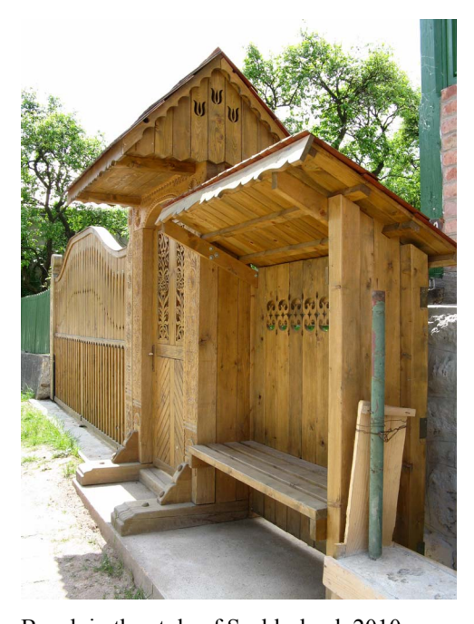
Bench in the style of Szeklerland, 2010

chat for a while, or just exchange a greeting. The villagers of Kalotaszentkirály are very proud that nearly all the homes are occupied by actual village residents. The occasional weekend home creates a space devoid of social life, a dead space in the village.