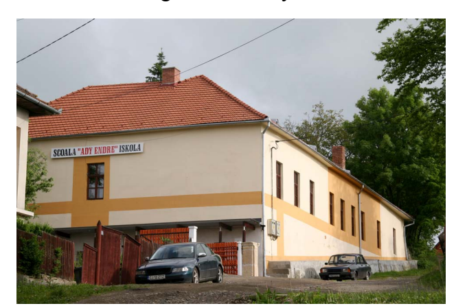
Main school building and gate, 2010

The village has recently been able to establish a Hungarian-language grade school, named