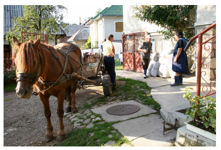
First day of potato harvest, 2007

was not economical to hire a tractor or combine, for the equipment would likely have to spend inordinate time traveling between fields. Additionally, the extremely narrow, "trouser-belt" holdings meant that a tractor might not even have room to turn around after a pass through the field, although a horse-drawn plough works just fine. But as farmers have become older and have gained income from non-farming sources, they have also begun to depend more on machinery where they can.