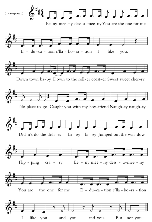
Fig. 5. Transcription of the clapping game "Eeny Meeny Dessameeny" as filmed at Monteney Primary School, Sheffield in 2009. Recording and transcription by the author.

The Opies' audio collection contains further information on the game, namely, a recording made in March 1975 by Iona Opie from girls aged 8-9 at the American School in