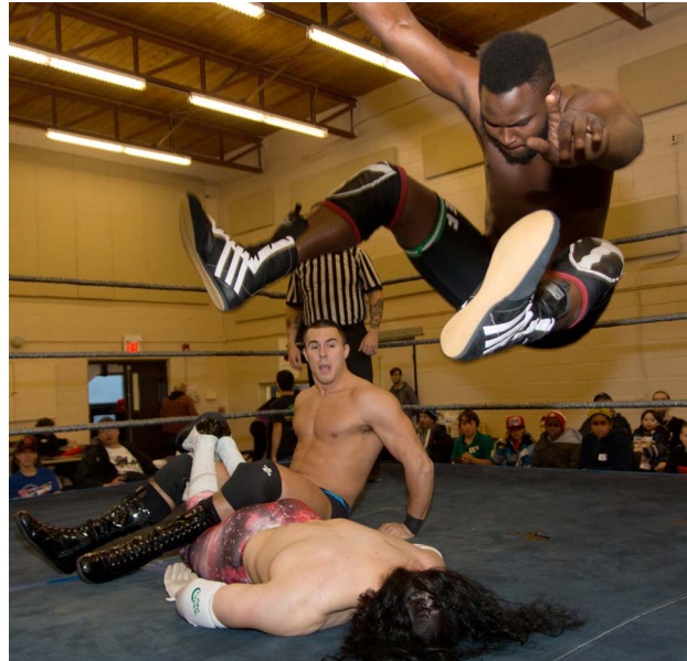
Image 2: This maneuver is a transitional move in a match, not a finisher. Image from Wikipedia: http://en.wikipedia.org/wiki/Leg_drop#mediaviewer/File:Chief_Ade_leg_drop.jpg . eCompanion: http://journal.oraltradition.org/issues/29i/duffy#myGallery-picture(4)

These examples only scratch the surface of what Parry-Lord theory can offer the study of professional wrestling narratives. The question then becomes whether the reverse is true: can studying professional wrestling further our understanding of oral poetry? A close look at professional wrestling reveals that it can.