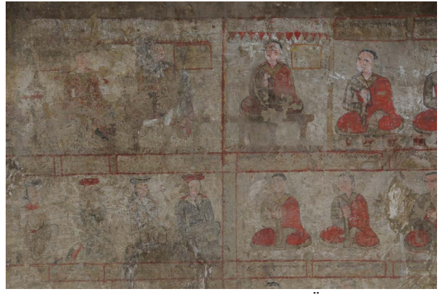
Fig. 3. Nagarāja (Na ga ra dza), Yeshe Ö (Ye shes 'od), Devarāja (De ba ra dza) and other historical figures, Tabo monastery, Entry Hall, south wall; photo by C. Kalantari, 2009.

Certainly, the consecration of the temple in the presence of its royal founders must have been the occasion of one or more authoritative speeches. Unfortunately, due to lack of evidence, we can only speculate about the form and content. What is evident, however, is that the underlying structuring principles of the religio-political order, as they are depicted in the paintings in the Entry Hall in Tabo monastery, to a considerable degree still play an important role at socio-political assemblies in the present. This can be seen, for example, in the attention given to the spatial arrangement of the various secular and religious dignitaries observed in the seating order practiced at village festivals or public religious ceremonies (see the examples discussed below in sections II and III). This happens, of course, in a modified or updated form, conforming to the development of religious, political, and other concepts, changed conditions, and different contexts.