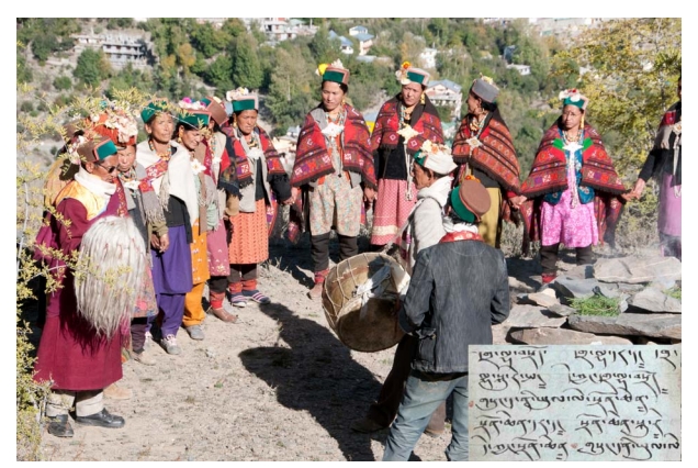
Fig. 10. Performance of ritual speech songs by a lay village priest; manuscript detail, Sherken festival, Pooh, Upper Kinnaur; photos by the author, 2002 and 2009.

It is also possible to classify certain forms of speech song as belonging to this category. An example of such a speech song or hymn (also related to a written version) that is recited more than sung is constituted by the performances of a lay village priest in Pooh in Upper Kinnaur on the occasion of the Sherken festival (see Jahoda 2011a for an account of this festival) (Fig. 10).<sup>22</sup> The lyrics of these "songs," or more precisely, the text of one written version (in standard Tibetan) of them was first edited, translated, and analyzed by Giuseppe Tucci (1966:61-112). Many of the themes, which inform the speeches described before, and the hierarchical order of religious, social, and cosmic levels, lha chos, mi chos , and so on, are also found here. In contrast to the aforementioned occasions, the performance of these speech songs takes place within a twofold wider framework, first outside in various ritual places within the sacred landscape of the village area, and second, as an explicit assembly of human beings and, in particular, also of gods. The latter are present in various forms, including by way of trance mediums (Fig. 11; see Jahoda 2011b for an analysis of these aspects in relation to the meaning of the festival).