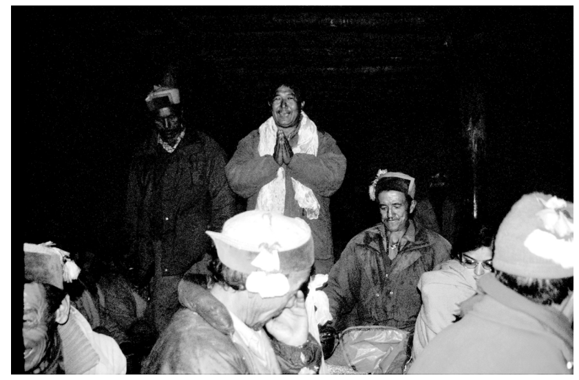
Fig. 6. Speaker ( mol ba pa ) at celebration of Phingri festival, Nako, Upper Kinnaur photo by the author, 2002.

village community. It is therefore quite different from Western annual birthday celebrations (although they are sometimes explained as such). Actually, the presentation of a new member and successor in a former tax-paying household belonging to the next generation who would guarantee the continuation of the family and household duties, also vis-à-vis the local village community, seems to be the customary historical basis underlying present-day Phingri celebrations.