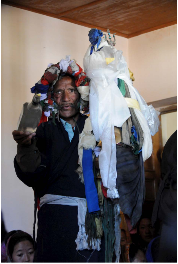
Fig. 13. Trance medium of the protectress Dorje Chenmo (rDo rje chen mo), Namkhan Festival, Tabo; photo by P. Sutherland, 2009.

This deity speaks to smaller or larger assemblies of the village people, including sometimes monks as well, on various occasions and in various places, also in the old temple ( gtsug lag khang ) of the monastery. The function of the trance medium or speechmaker is fulfilled has long been fulfilled by an illiterate man. Between 1997 and 2009 I was witness to a number of such speeches and performances by this trance medium. The performances and the speeches are of considerable length, usually at least some 30 minutes, sometimes up to one hour. As far as I know, no written texts exists that underly the speeches of this trance medium or are produced thereafter.