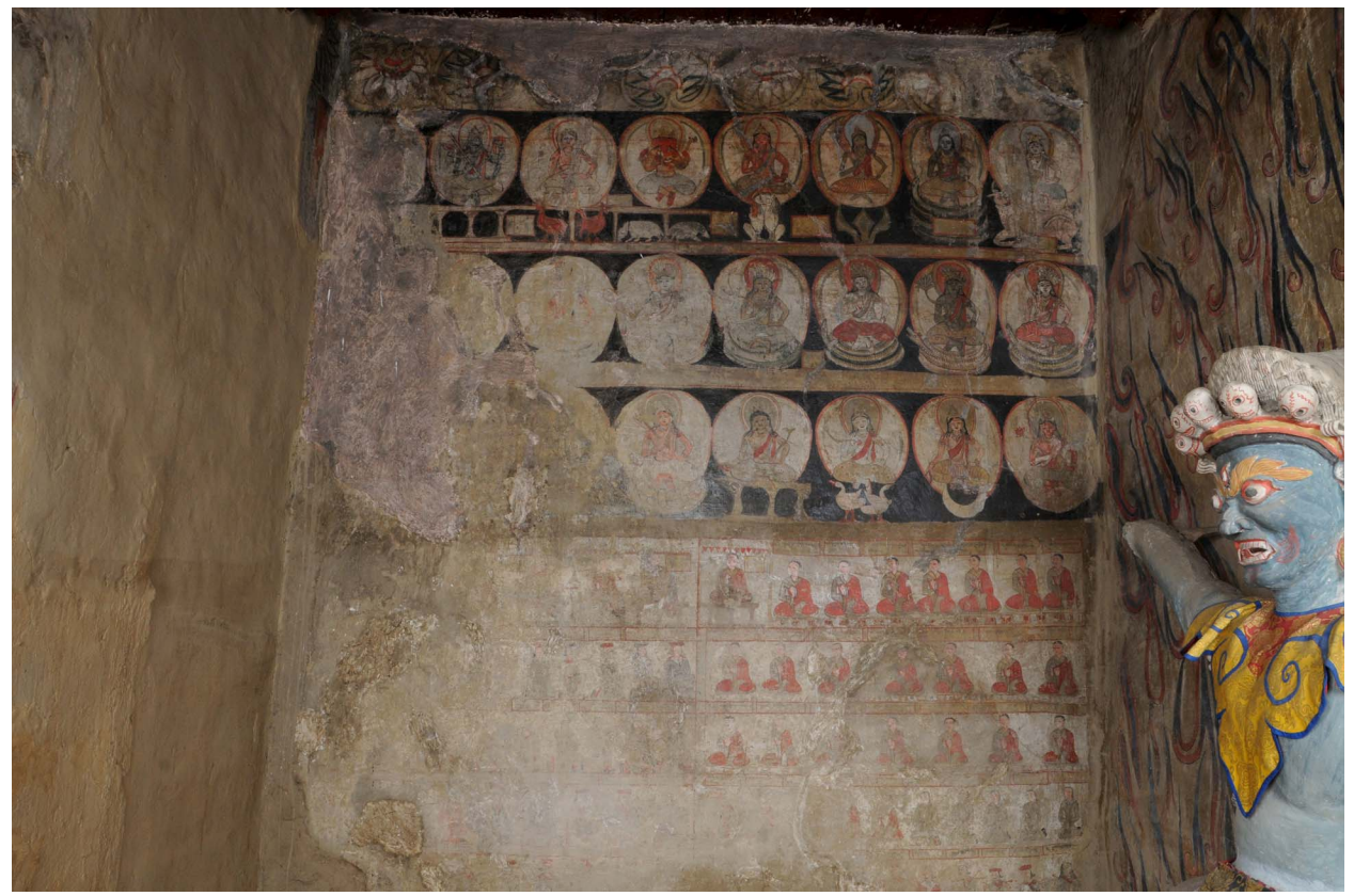
Fig. 2. Wall paintings of rows of deities (upper registers) and historical figures (lower registers), Tabo monastery, Entry Hall, south wall; photo by C. Kalantari, 2009.

In this context, the question of seating positions and status becomes relevant. For late tenth-century Western Tibet, we are lucky that a visual example of such an assembly of secular and religious dignitaries, headed by members of the royal dynasty, together with a depiction of the local aristocratic elite is preserved in paintings in the Entry Hall (T. sgo khang ) of Tabo monastery (Fig. 2).