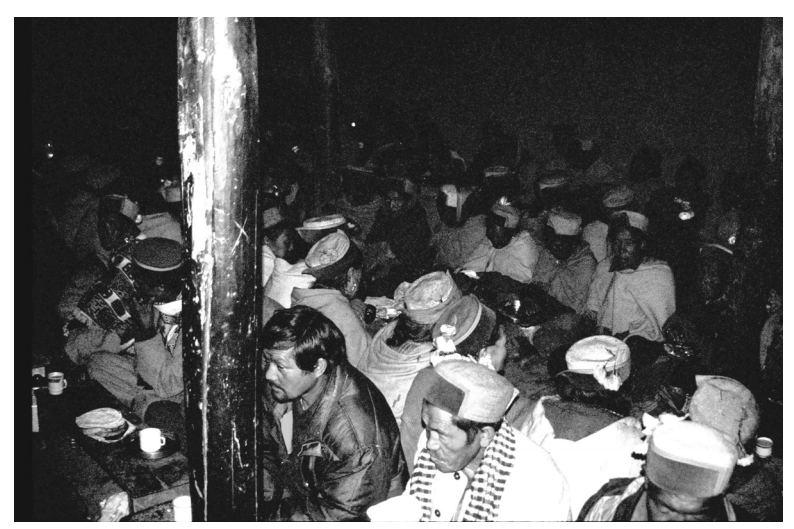
Fig. 5. Assembly of village people, Nako, Upper Kinnaur; celebration of Phingri (Bang ri?) festival; photo by the author, 2002.

I became aware of the existence of such speech traditions and associated socio-political assemblies as an ongoing living tradition among local communities in Spiti and Upper Kinnaur for the first time during a visit to Nako village in Upper Kinnaur in mid-September 2002. The village people of Nako, mainly members and representatives of households with full rights ( khang chen ), had gathered in the evening in the community building to celebrate the Phingri festival (Fig. 5). The exact meaning and spelling of this name—perhaps bang ri in Tibetan—is