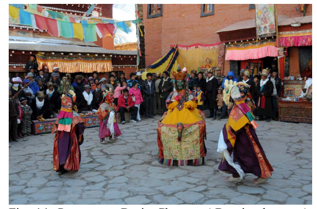
Fig. 14. Protectress Dorje Chenmo (rDo rje chen mo), Namtong festival, Khorchag monastery, Purang; photo by P. Sutherland, 2010.

Until forbidden some 40 years ago,<sup>25</sup> there used to be a trance medium of Dorje