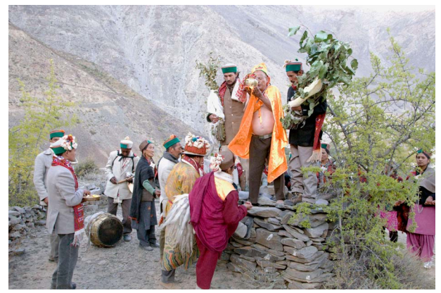
Fig. 11. Dabla (dGra lha) trance medium, dog ra ground, Sherken place, Sherken festival; photo by C. Kalantari, 2009.

<sup>22</sup> The exact relationship between this written version (dating from the last few decades, presumably a copy of an older written version) and the one performed orally in 2009 still needs to be clarified in detail. An explorative recording of a small part of the speech songs made in 2002 in the home of the priest by Dietrich Schüller and Veronika Hein together with the author showed that, at least without prior rehearsal of the songs (which he seems to do before the oral performance during festival time), he tried to adhere to the written text as much as possible.