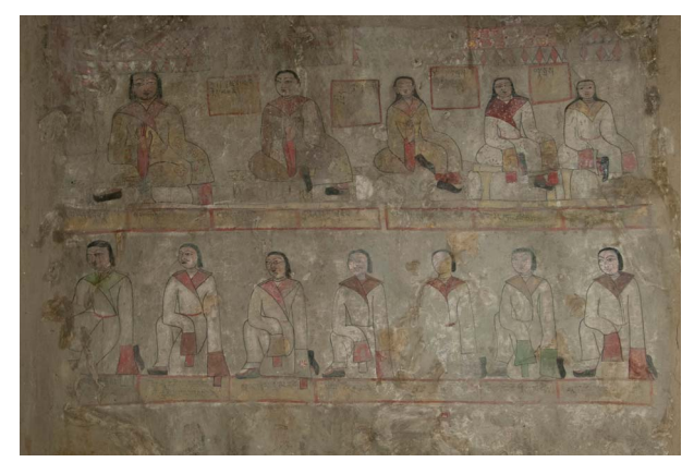
Fig. 4. Wall paintings of rows historical figures, Tabo monastery, Entry Hall, north wall; photo by P. Sutherland, 2009.