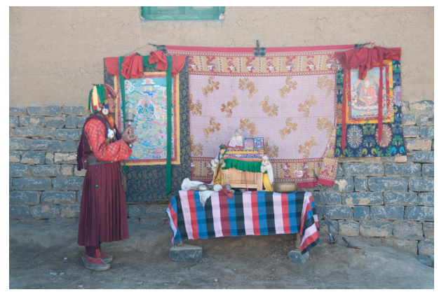
Fig. 8. Mes mes bu chen during the performance of a play ( rnam thar ), Pin valley, Spiti photo by C. Kalantari, 2009.