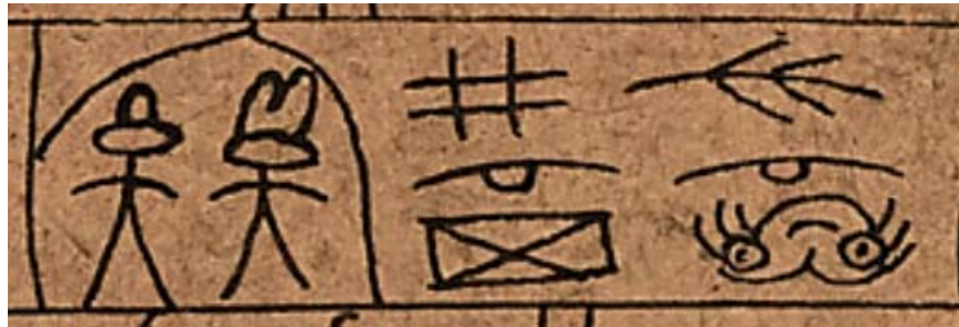
Fig. 8. An example of vertical composition. MEB 481-4 (24).

The dongba writes his word-for-word composition one character after the other, left to right, which differs from the somewhat more aesthetically balanced graphic composition of the passages in oral mode, where characters are often placed atop one another to fill in space. From the same page: