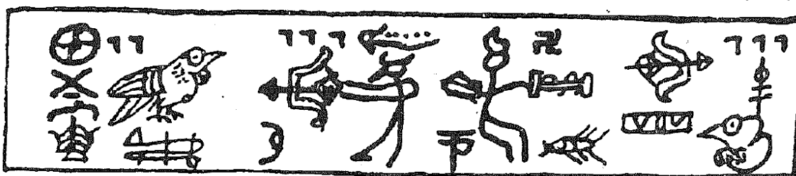
Fig. 4. Story episode: “Coqsseileel’ee shoots the magpie” (Mu and Yang 2003:3).

On the next day, the magpie had to rest, and rested on the fence. Coqsseileel’ee picked up his bow and arrow and took aim, but couldn’t aim straight. Ceilheeqbbubbeq, sitting at the loom, took out the shuttle and then touched Coqsseileel’ee’s arm, he fired his arrow and hit the magpie. From the magpie’s throat came three flax seeds.