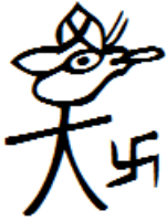
Fig. 1. Naxi dongba script for the creation hero, Coqsseileel'ee (Fang 1981:363).

In terms of the names of epic heroes, Naxi ritual texts often employ simple adverbial epithets. The four syllable name of the Naxi creation hero, \text{ts}^{\text{h}}\text{o}^{\text{t}}\text{J} \text{ze}^{\text{t}} \text{[u]r}^{\text{t}} \text{xu}^{\text{t}} (Naxi pinyin Coqsseileel'ee 10 ) is often written \text{ts}^{\text{h}}\text{o}^{\text{t}}\text{J} \text{ze}^{\text{t}} \text{[u]r}^{\text{t}} \text{xu}^{\text{t}} \text{xu}^{\text{t}} 11 with an extra final syllable, \text{xu}^{\text{t}} , to make the name fit into one whole intonation unit of five syllables (a “line” of Naxi poetry). The reduplicated final syllable ( \text{xu}^{\text{t}} , meaning “good” in Naxi) in this instance emphasizes the worthy, virtuous nature of the post-flood ancestor; a mini-epithet that turns the name into an oral formula.