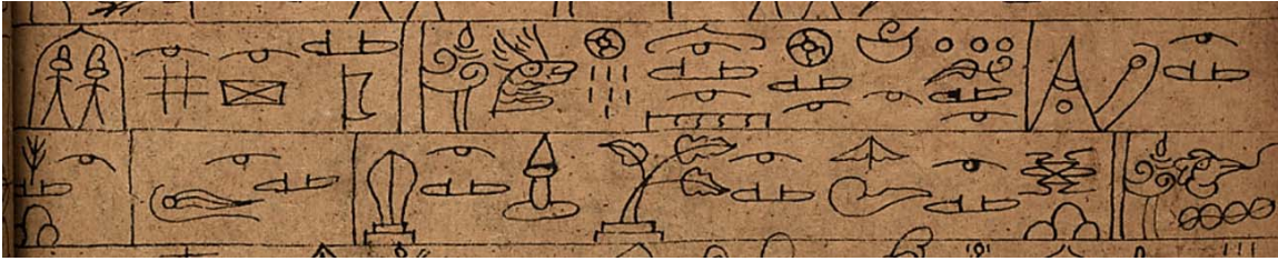
Fig. 3. Naxi creation myth from the sacrifice to the wind ceremony (MEB 481-4 p. 29).

The first line after the opening formula (in fact all the following lines could be said to be formulaic, if not recognizable formulas) is muł məł t'vł tuł dzułł (sky / not / appear / that / time). The following lines follow the same structure, with more syllables added for the more complex nouns. It should also be noted that modal particles are added in places where the syllable count would otherwise end up even, such as dzułł nał zoł loł lał məł t'vł tuł dzułł , the modal “ lał ”, here an emphatic, is appended to holy mountain dzułł nał zoł loł to make the line nine syllables instead of eight.