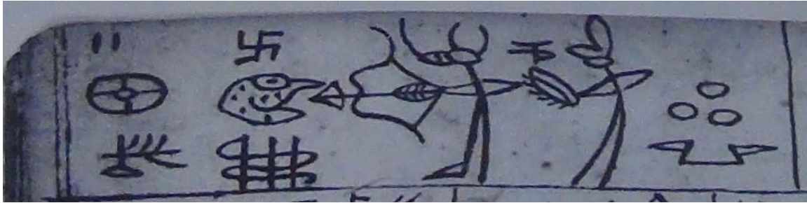
Fig. 5. Coqsseileel'ee shoots the magpie, Delivering the souls of the dead (DWYS 56:180).

introduced by either the dongba or the transcriber.