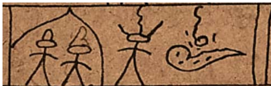
Fig. 7. The dongba wishes good fortune on the household (MEB 481-4, p. 24).

The text in the passage directly preceding this reads in oral mode, with only three compound characters representing the utterance: