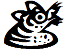
Fig. 2. Naxi dongba script for tiger (Fang 1981:186).